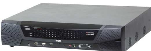
KN8164V Front View